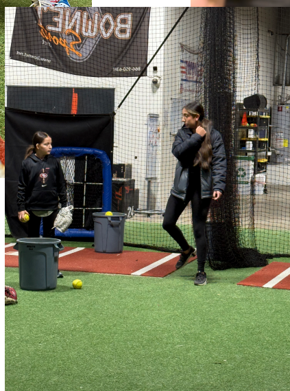
Top Dog Baseball